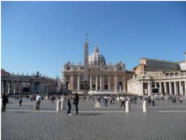
St. Peter's Square, Vatican City