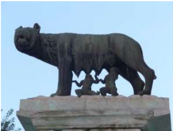
Romulus and Remus, Capitolio