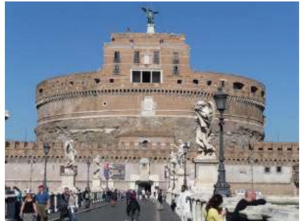
Castel Sant'Angelo, Vatican